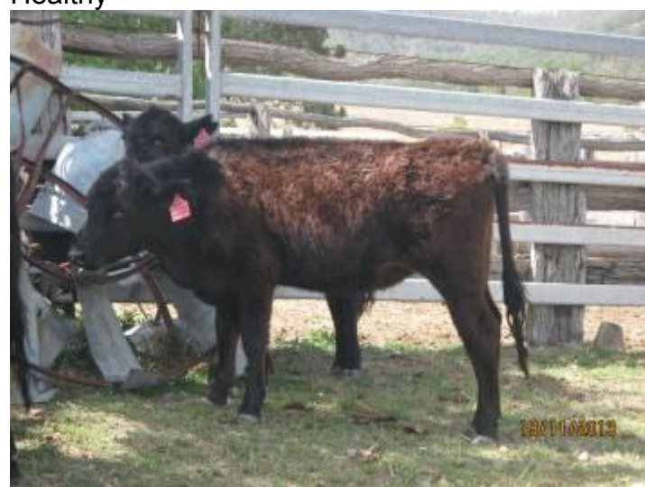
Weaners 7 – Healthy