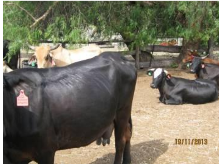
Cattle 1 – Healthy – had cydectin pour on