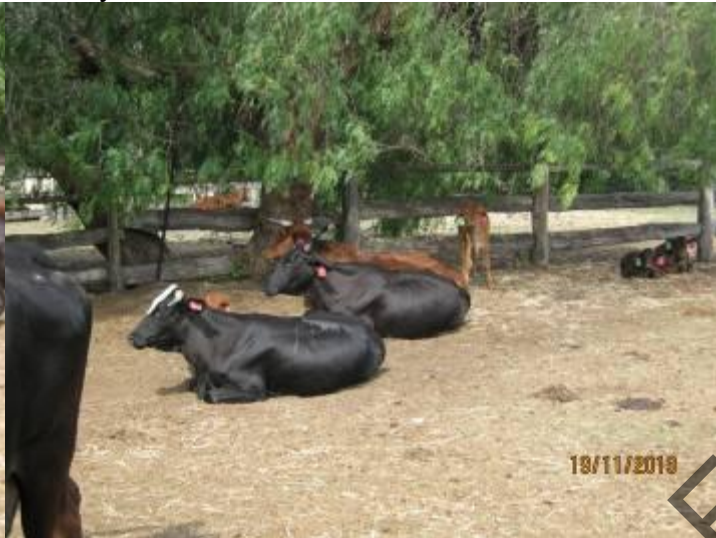
Cattle 2 – Healthy