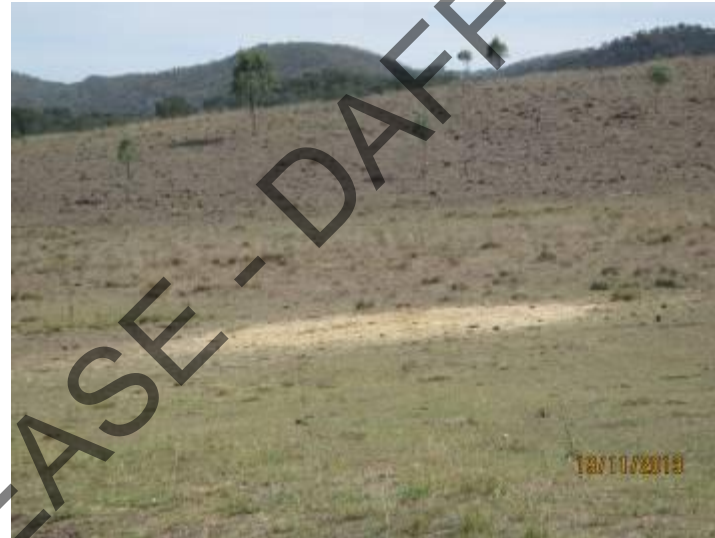
Feeding 3 – Evidence of previous feeding of cattle