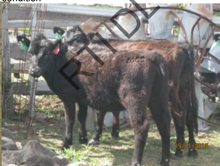
Weaners 6 – Weaners in good condition