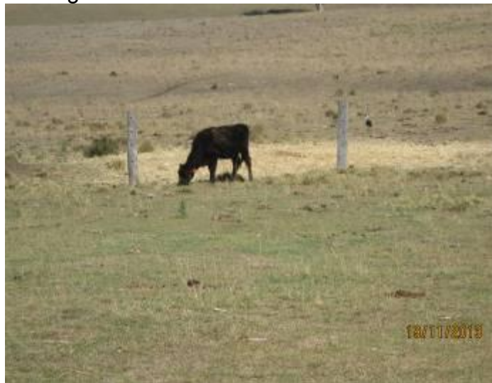
Feeding 5 – Previous feeding