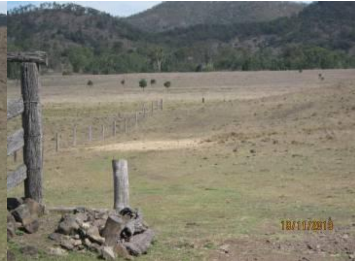
Feeding 4 – Previous feeding of cattle