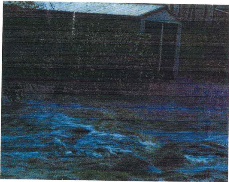
Photo 1 showing flood prone area affecting access from Eastern Temporary track