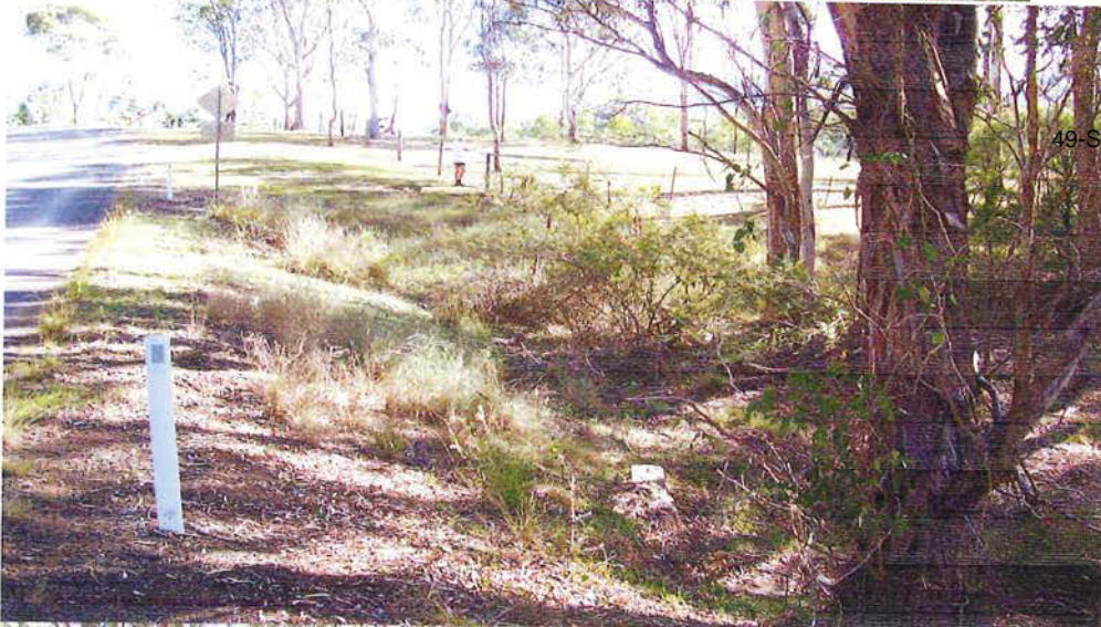
Photo 7 ,looking from culvert West to combined driveway 49-Sch4 - Personal Information 49-Sch4 - Personal Information driveway starsts at top left of photo